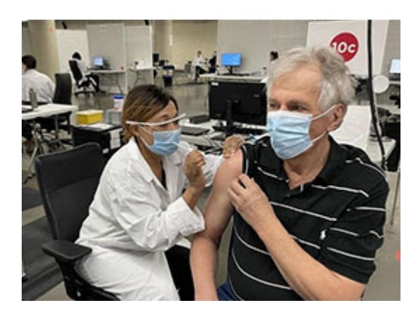
March 11 marks the beginning of the third year since the World Health Organization formally declared COVID-19 a pandemic, read Unifor's statement.