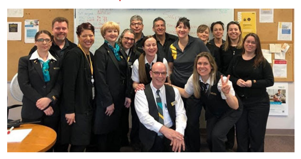
Unifor plans to aggressively fight back against the federal government's plan to privatize the VIA Rail corridor.