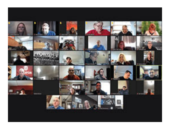
Unifor's IPS Council gathered to address the challenges and opportunities of building a strong and resilient auto parts industry.