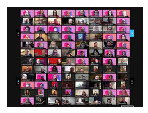
Nearly 200 women from across Canada joined the International Women's Day Online Event to build union sisterhood, celebrate strides toward equality and prepare for the challenges